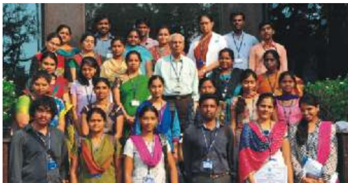
Enthusiastic participants at the VIBS program

A hands on summer training programme was conducted by the Vidyasagar Institute of Bio-Medical Science between 19th May and 6th June 2014. A total of 13 participants (4) in Biochemistry & Cell Biology, (4) in Genetics & Molecular Biology and (5) in L&T Microbiology departments from SRM Medical College Hospital & Research Centre(1), Bharathidasan University, Tiruchirappalli(1), Annamalai University, Chidambaram(1), Shri Sadguru Seva Sangh Trust, Chitrakoot(1), Mysore Medical College and Research Institute, Mysore(1), SRM University, Chennai(1), Anna University, Guindy Campus, Chennai(1), Madurai Kamaraj University, Madurai(1), College of Science & Technology, Andhra University, Visakhapatnam(2), Loyola College, Chennai(1) and Satyabama University, Chennai (1), Vels