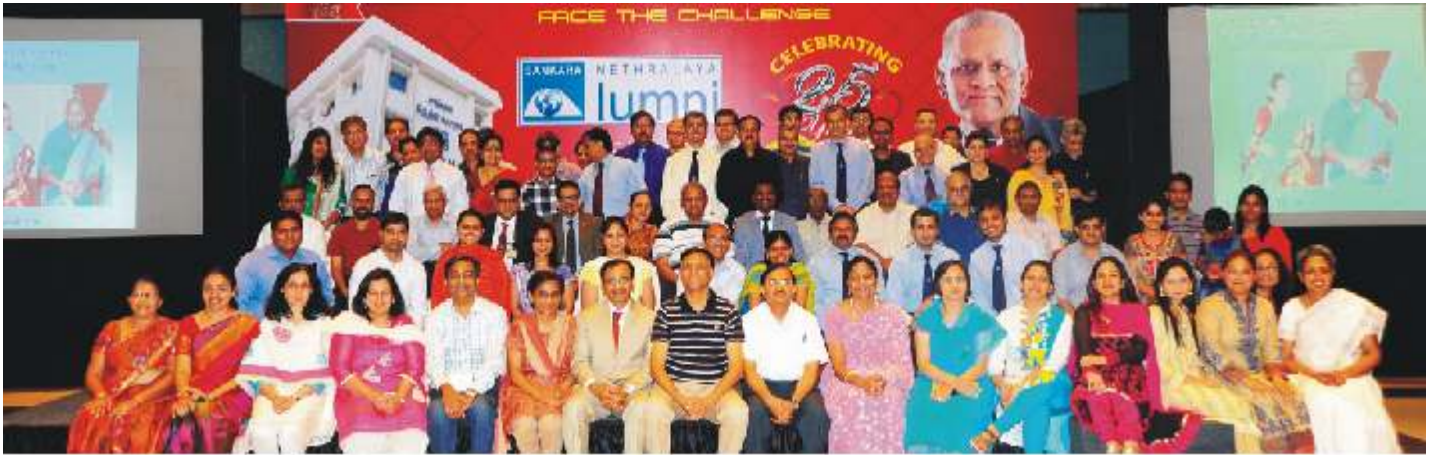
SN Alumni meet at GRT Temple Bay, Mammallapuram