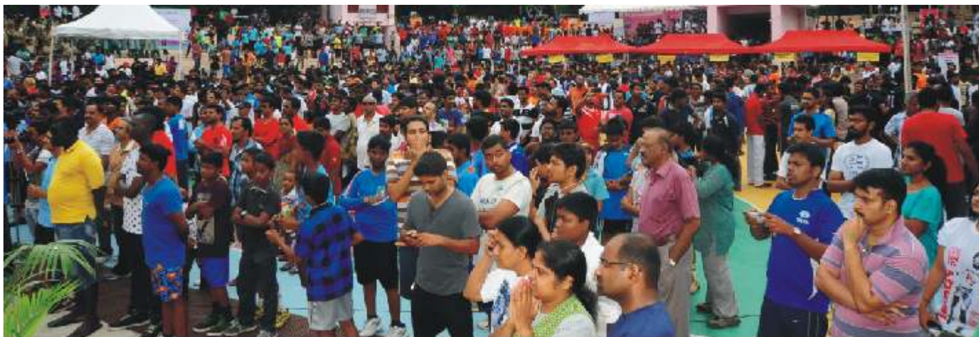
Participants at the 'Terry Fox' run