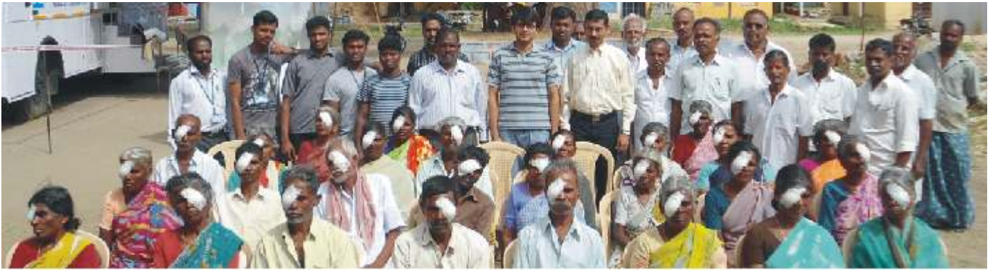
Patients at the MESU camp at Periyamuthur, Krishnagiri District