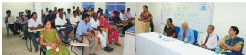
TSNA counselling session

A career counselling session was organized by the Sankara Nethralaya Academy at its Vanagaram campus, Chennai on 13th July 2014 to facilitate students completing their schooling to discover new range of courses in the healthcare sector that could help them build a great career.