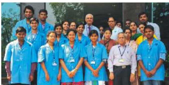
Enthusiastic participants at the BITS PS-I program

The BITS Practice School-I Programme was conducted by the Vidyasagar Institute of Bio-Medical Science between 23rd May and 17th July 2014 at the Sankara Nethralaya main campus. A total of 10 students from different BITS campuses comprising 3 from BITS Pilani, 6 from BITS Hyderabad and 1 from BITS Goa participated. The participants were split into 5 groups and assigned to five departments as follows 3 students at R.S Mehta Jain Department of Biochemistry & Cell Biology, 3 students at L & T Microbiology Research Centre, 2 students at SN ONGC Department of Genetics and Molecular Biology and 1 student each at the Nano Biotechnology and Information Technology & Systems Departments.