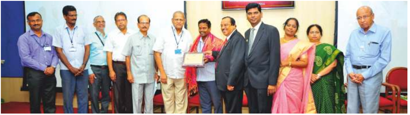
Helen Keller Remembrance day at Sankara Nethralaya