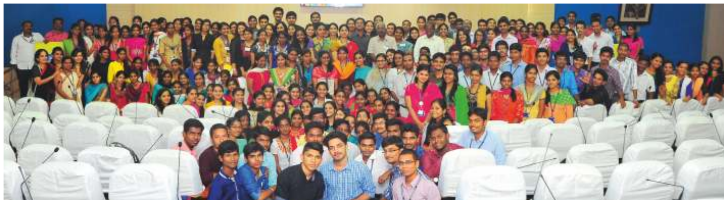
Enthusiastic participants at the 15th Dr E Vaithilingam Memorial Scientific session

Dr. E Vaithilingam Memorial Scientific session was successfully conducted by the Elite School of Optometry for the 15th time on the 6th and 7th of August 2016 at Sri V D Swami Auditorium. Around 325 delegates participated including 103 delegates from 12 different schools of Optometry located across the country.