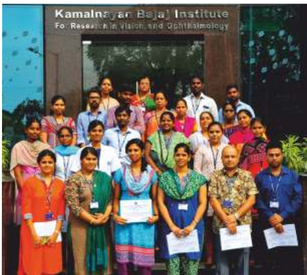
VIBS Hands on training program

The annual Hands-on-summer training programme conducted by the Vidyasagar Institute of Bio-Medical Science (VIBS) a Unit of Medical Research Foundation, with an objective of imparting real time knowledge and experience to post graduate students in their chosen fields, was held this year between 11th May and 31st May 2016. A total of 9 PG students from all over the country including one overseas student participated in this year's hands on training program.