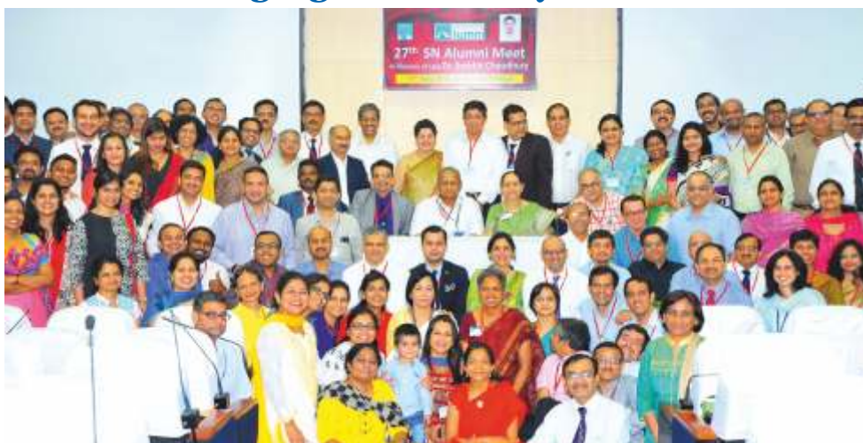
Participants at the 27th SN Alumni meet