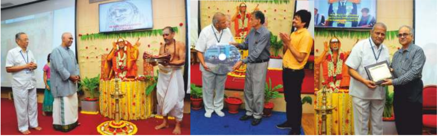
Maha Periyava Jayanthi celebration at Sankara Nethralaya