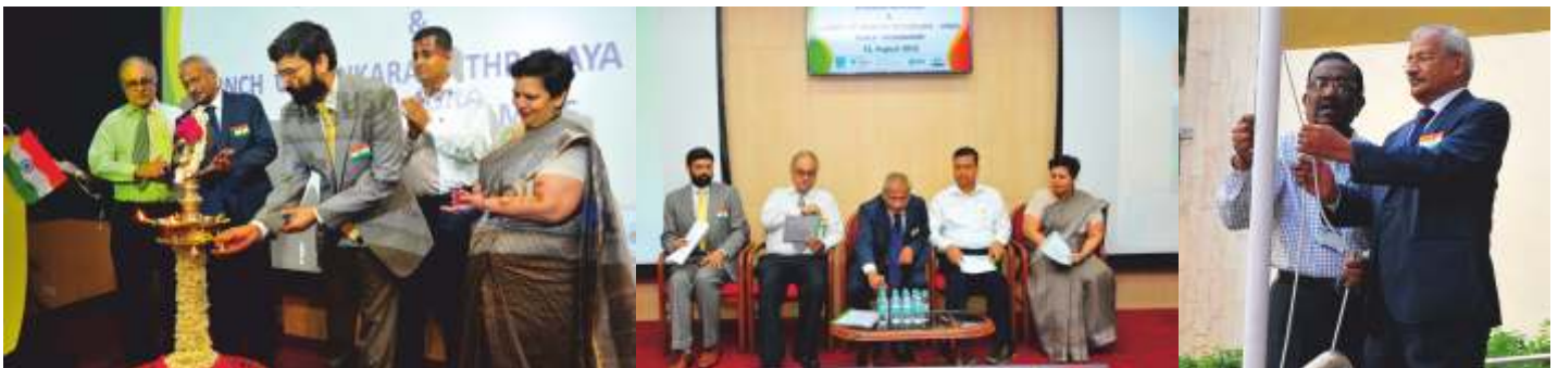
Orbis International launches "REACH" program on Independence day